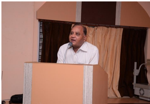
Welcome address by the Principal