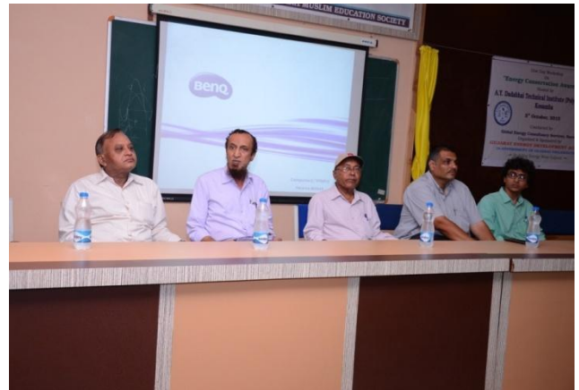
Delegates on the dais