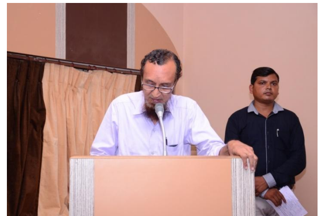
Inauguration address by the Director