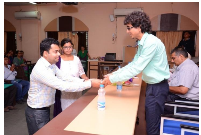
Our staffs welcome the guests